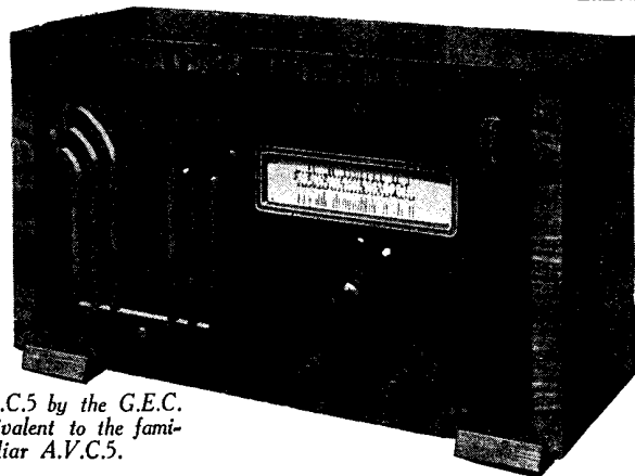
The D.C.5 by the G.E.C. is equivalent to the familiar A.V.C.5.

The dial lamps are the 3.5 v. .3 amp. type. If this type does not have a satisfactory life the 6.4 volt .4 amp. 12 mm. MES type may be substituted. With the latter the illumination will not be so bright.