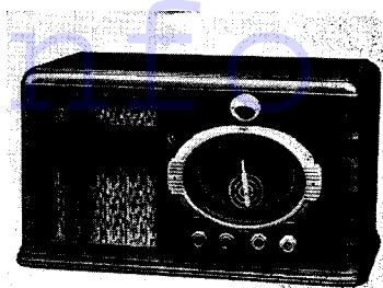
Belmont describe their Model 700 as a seven-valve instrument, the seventh valve being the cathode-ray type tuning indicator. The set is a 3-waveband superhet for A.C. operation.

CIRCUIT. —The aerial is inductively coupled to V1, a heptode, where the incoming signals are mixed with those generated by V2, a triode valve acting as a separate oscillator. The resulting frequency then passes through an I.F. transformer to V3, an H.F. pentode acting as the I.F. amplifier.